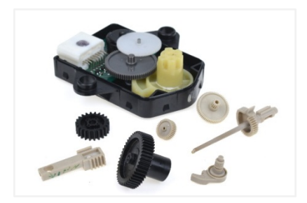
[Foto 5] Heat-, blister- and chemical-resistant: Exhibited by Kuraray at Fakuma 2018, Genestar is a highly robust engineering plastic that is ideal for processing by extrusion and injection molding.