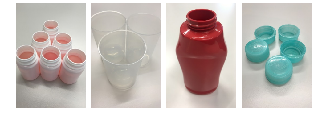
[Foto 4, 5, 6, 7] The copolymer Eval EVOH from Kuraray protects foods against oxygen in packages just a few micrometers thick, now also available for co

[Foto 3] Facilitating a smooth ride, the triblock copolymer Hybrar from Kurary has exceptional damping properties toward noise, vibration, and shocks. With its high resistance to heat and weather influences, it is suitable for challenging applications in vehicles, sports equipment, and the electronics industry.