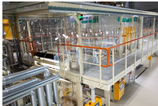
[Photos 5 and 6] Real-time sensors for high-tech film production: At its site in Troisdorf, Kuraray produces high-quality PVB films, which are used as interlayers in safety glazing for demanding architectural and automotive applications. Together with researchers from the Fraunhofer Institute (FIT), Kuraray is testing how new 5G sensors can improve quality and reduce waste, emissions and energy consumption.